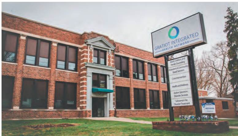
Main Office, 608 Wright Avenue, Alma, MI. 48801