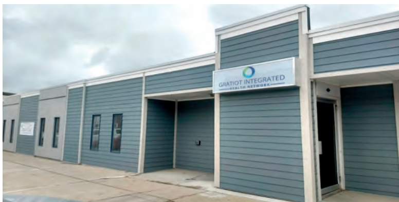
Integrated Health Clinic, 224 North Mill Street, St. Louis MI. 48880